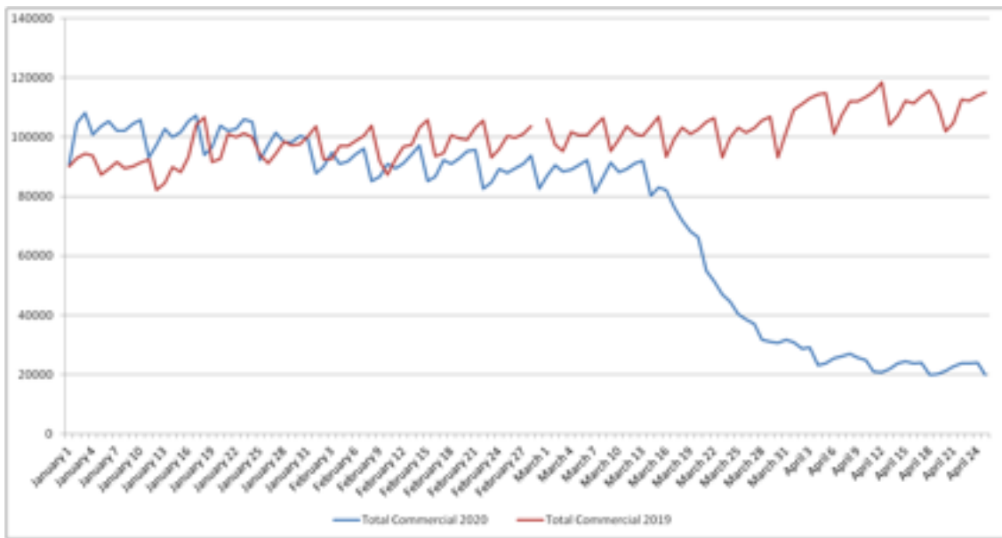
Fig. 1 Number of commercial flights: comparison between 2019 and 2020 (January 1 – April 25)

This fall effect refers to a situation of strong economic criticality and explains that the interactions at macro level change, as well as at micro level agency and routines change and digital socialization increases along with social inequalities. We assisted also at what in sociology are called collective behaviours consisted of a global set of individuals subjected to the same stimulus, who react and interact in situations without certain reference to defined roles.